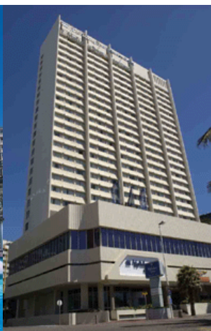
Garden Court South Beach