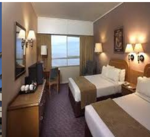
Garden Court Interior