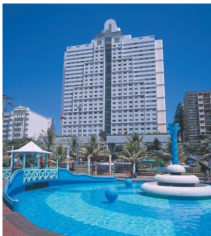
Garden Court South Beach Hotel