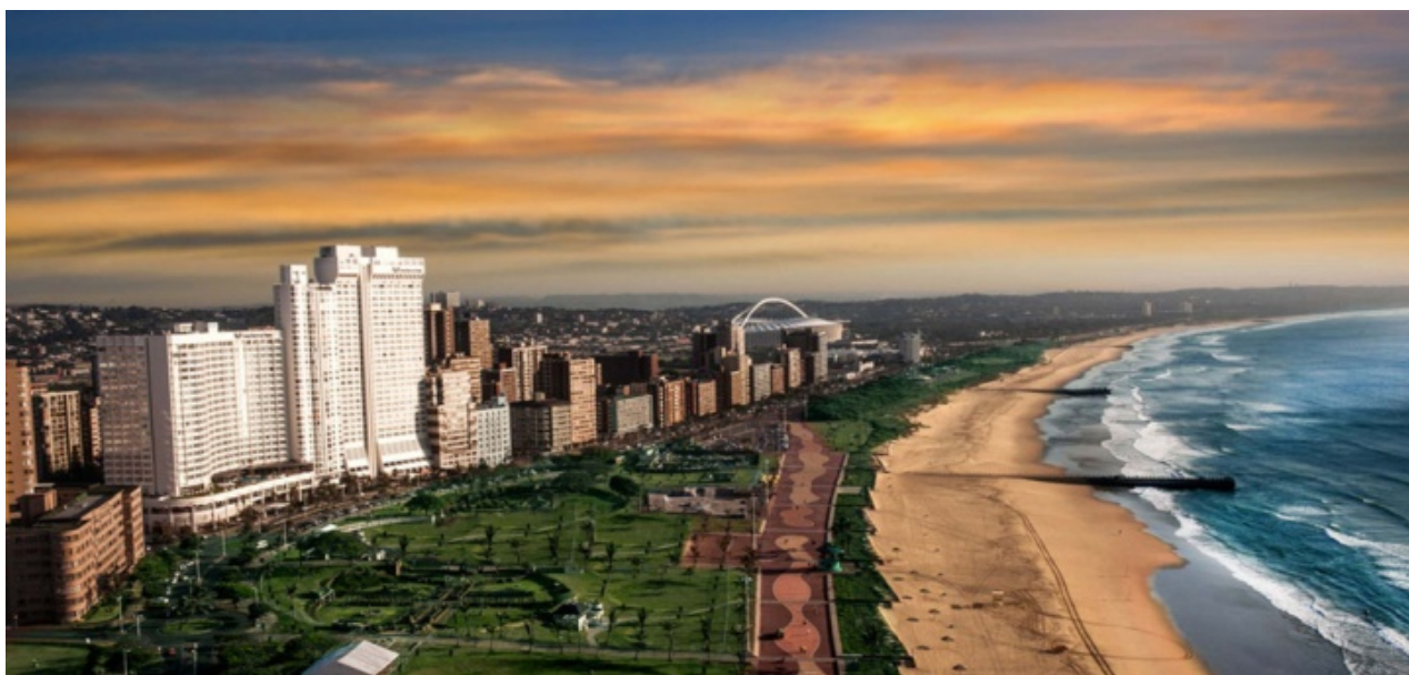
Elangeni & Maharani Hotels