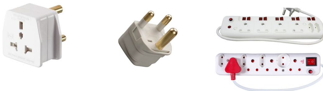
Multi Plug Converter Easily available at all retails stores