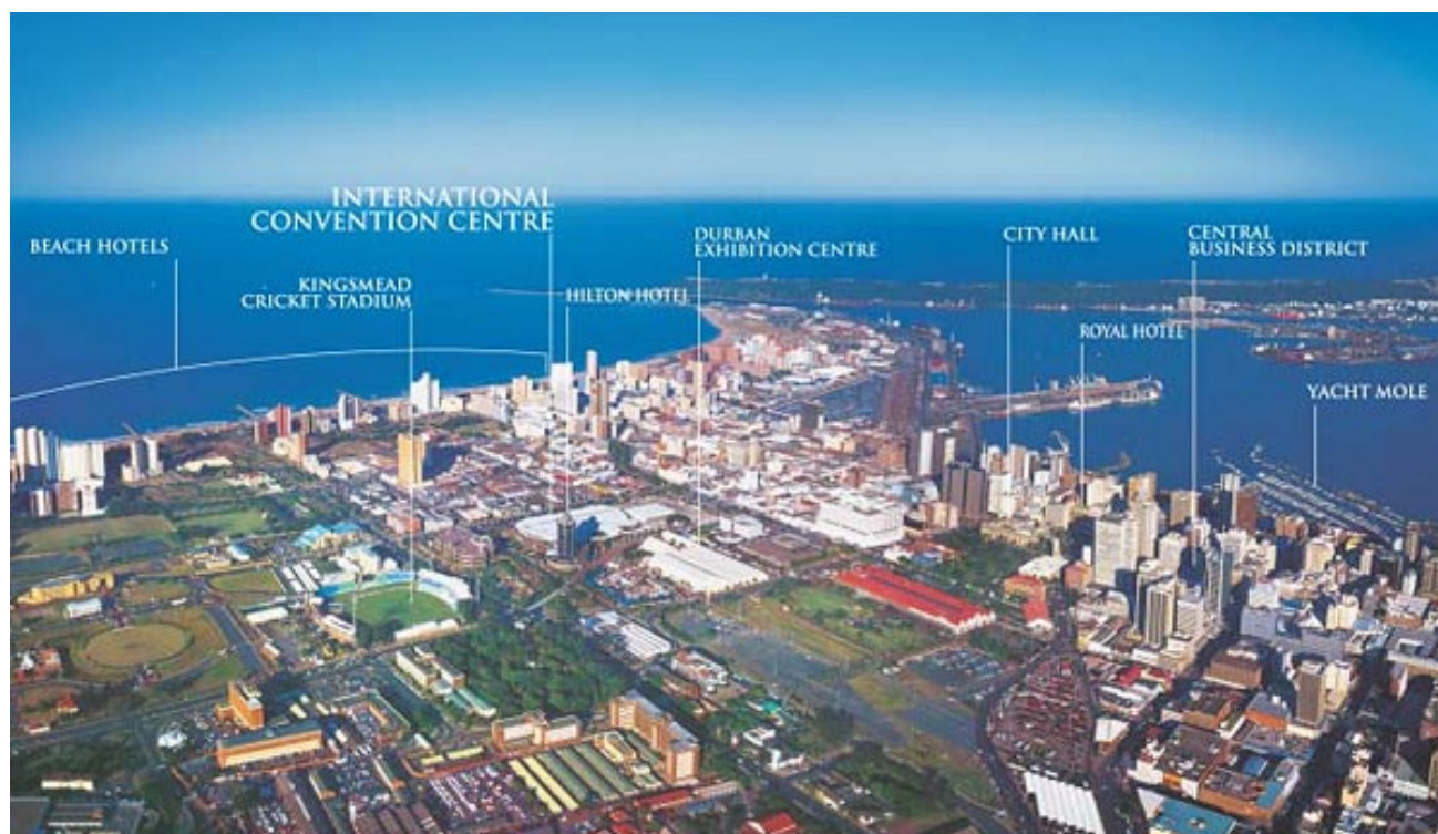
The Official Accommodation and the ICC is within a 2 km radius

For more information, please visit www.icc.co.za .